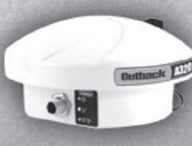
Outback A320/321™ Dual Frequency GPS/GLONASS RTK

OutbackGuidance.com Your on-line guidance connection.