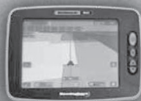
Outback MAX™ GPS Guidance System

Friday, February 15, 2013 9 a.m. - 5 p.m. Golden Plains Ag Tech 650 E. Pine, Colby 785-462-4120