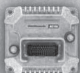
Outback AC110 with Auto Rate and Section Control