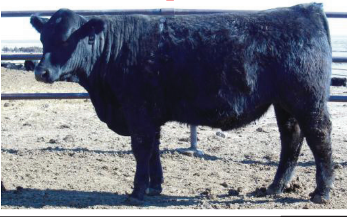
Lot 48 – Home Run