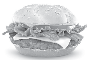
Bacon Habanero Ranch