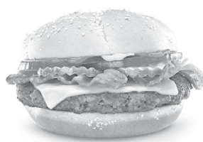
Bacon and Cheese