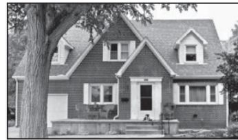
208 N. Griffith - $112,000

Home Range Real Estate Inc. | 157 S. Penn Ave., Oberlin, Kan.