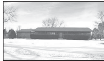
408 N. Elk - $98,000