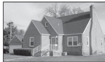
212 E. Hall - $107,000