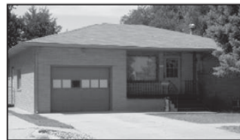
113 S. East - $59,500

Featuring 4 brick homes with 3 to 7 bedrooms. Two of the homes are completely updated with a new furnace, air conditioning, roof & appliances.