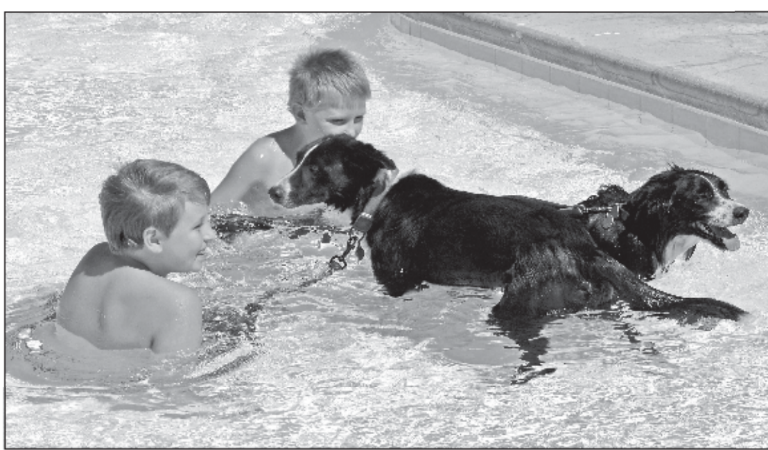
Goodland canines get their day at the pool