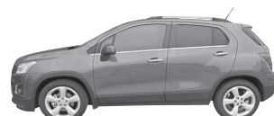
NEW 2015 CHEVY TRAX