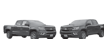
NEW 2015 CHEVY COLORADOS