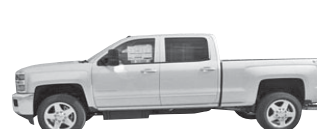
NEW 2015 CHEVY SILVERADO HD2500 $58,880 -$8,832 Savings $50,048