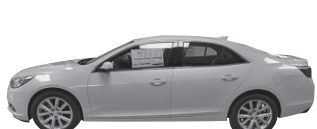
NEW 2015 CHEVY MALIBU $27,290 -$4,094 Savings $23,196