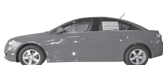
NEW 2015 CHEVY CRUZE $22,275 -$3,341 Savings $18,934