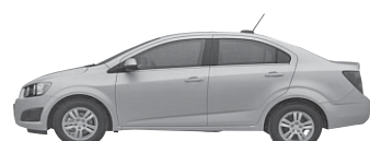
NEW 2015 CHEVY SONIC $18,270 -$2,741 Savings $15,529