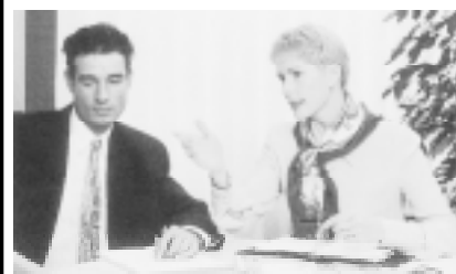
Performance in Quiet

Because your hearing environments change, so do Audioflex's capabilities. Its two program design provides two completely different listening options. One is for quiet settings at home or in the office. The second program is designed for noisy hearing environments. A remote control allows easy access to both programs.