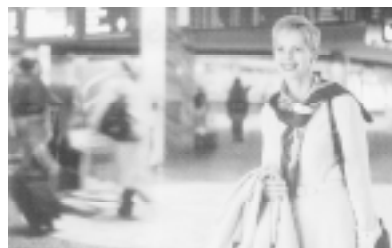
Comfort in Noise

Please join us at the beautiful Fairview Estates, located at 1630 Sewell Ave., Colby, on April 2nd from 10:00 a.m. to 4:00 p.m.