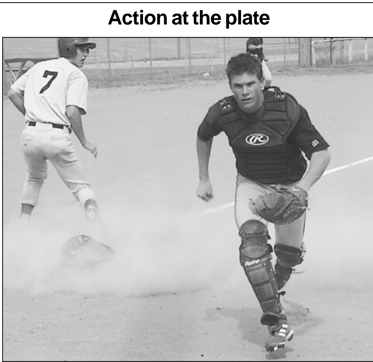
Action at the plate