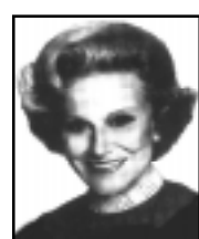
Abigail Van Buren

There are usually any number of chores to be done around a house, from painting to washing windows, fixing a fence, clearing out a garage,