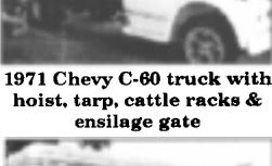
1971 Chevy C-60 truck with hoist, tarp, cattle racks & ensilage gate