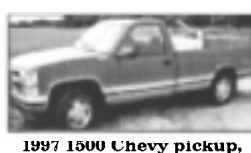
1997 1500 Chevy pickup, 4 x 4, 40,100 miles w/5 wheel hitch.

NOTE: All statements or representation herein are believed to be correct. The auction firm makes no warranties either expressed or implied. Announcements made day of sale shall take precedence over printed material. All guarantees are between buyer and seller. TERMS: Cash day of sale.