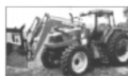
1999 Case IH MX 120 MFD tractor, 1020 hrs., S.N. JJA0097598, with Woods-Dual 260 loader, bucket, grapple forks & bale forks

From the junction of Hwy 24 & Hwy. 23 in Hoxie, Kan.: 5 3/4 miles east on Hwy. 24 and 1/4 mile south. From the Graham-Sheridan County Line in Studley, Kan.: 9 1/4 miles west on Hwy. 24, then 1/4 mi. south.