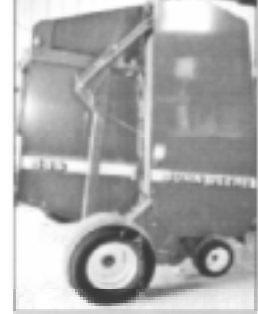
JD 566 round baler. Total bale count - 3558