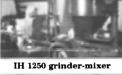
IH 1250 grinder-mixer