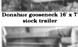
Donahue gooseneck 16' x 7' stock trailer