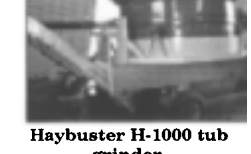
Haybuster H-1000 tub grinder.