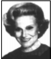
Abigail Van Buren

Abby, would I be out of line to ask my sister not to follow through on her plan? The grave is near the center of our family plot, and I think the bush would be out of place. And who would be responsible for the care of the roses? I