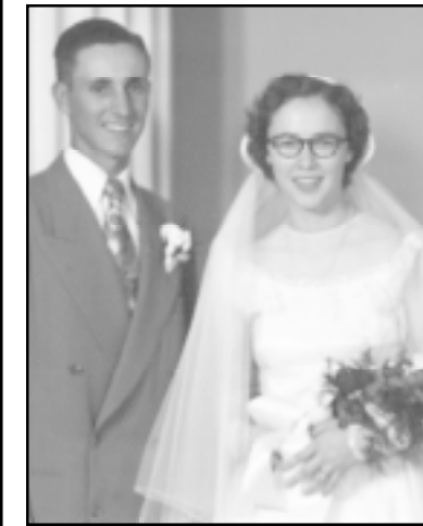
The Saddlers in 1951

Please feel free to send your congratulations to 710 North Country Club Drive, Colby, Kan. 67701.