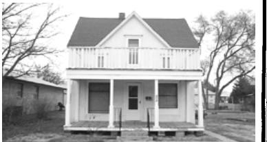
575 W 7th $38,000.00 4 BR, 2 Bath, 1 Car Grg. CALL ROCK WAITING FOR YOU!!