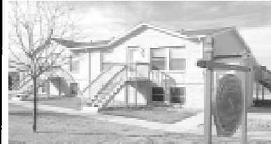
440 S. Court Ave $350,000.00 NEW TERMS FOR BUYER!! CALL MOLLY!