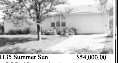
1135 Summer Sun $54,000.00 2 BR, 1 Bath, 1 Car Grg. CALL STEVE WELL-MAINTAINED!!

COUNTRY HOMES: LG-320a cropland w/nice homestead which can be purchased separate on an 8ac tract—JUST LISTED!! SD—"RARE FIND"—17a cropland & grass w/improvements just NW of Studley TH-338± cropland, grassland & NICE improvements S of Levant on the blacktop LAND LISTINGS: WA-640a CRP 7 mi N of Sharon Springs WA- 7 Quarters of dryland 5 mi N of Sharon Springs LG-480a grassland w/2 windmills & live water S of Monument TH-160a sprinkler irr S of Mingo TH-181a sprinkler irr & dryland in SE Thomas County LG-640a CRP & cropland in Western Logan County RA-1280a grass w/4 windmills, excellent fences & 320a cropland UPCOMING AUCTIONS: 11/2/01—KARLIN ESTATE Farm Machinery & Equipment Auction—Sale will be @10:30 AM NW of Oakley 11/7/01—FIRST NATIONAL BANK—Commercial building in downtown Colby at 360 N. Franklin