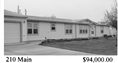
210 Main $94,000.00 4 BR, 3 Bath, 2 Car Grg. CALL MOLLY WOW...WOW...WOW...!!