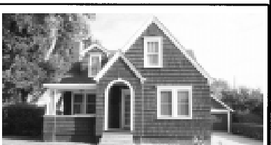
985 W 5th $95,500.00 3 BR, 3 Baths, 2 Car Grg. CALL MOLLY COME TAKE A LOOK!!