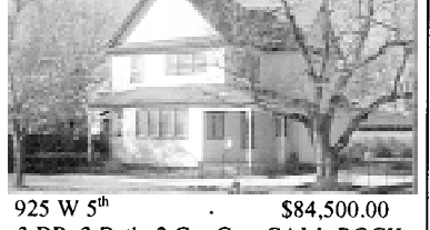
925 W 5th $84,500.00 3 BR, 2 Bath, 2 Car Grg. CALL ROCK MAKE AN OFFER!!!!