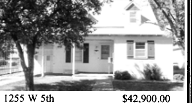
1255 W 5th $42,900.00 4 BR, 3 Bath, 1 Car Grg. CALL MOLLY INVESTOR'S DELIGHT!!!!