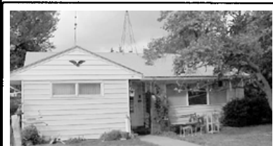
680 S Grant $48,500.00 2 BR, 1 Bath, Carport. CALL MOLLY EXCELLENT LOCATION!!