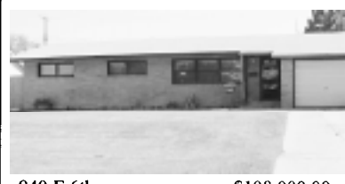
940 E 6th $108,000.00 4 BR, 3 Baths, 1 Car Grg. CALL MOLLY BRICK BEAUTY!!!!