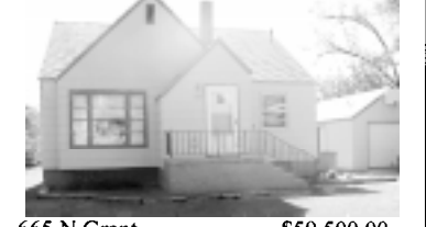
665 N Grant $59,500.00 3 BR, 2 Bath, 1 Car Grg. CALL MOLLY CHARM, PRICE, ROOM!!!