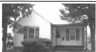
830 W Plum $34,500.00 2 BR, 1 Bath. CALL MOLLY CHARMING HOME