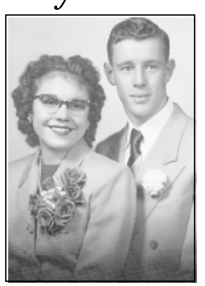
Fockes 50 years ago