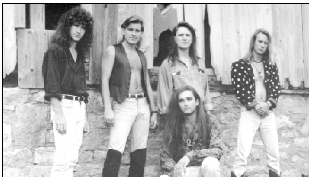
"No Parking" Band Reunited for Two End-of-Year Shows

Northwest Kansas area band "No Parking" is reuniting for two shows at the City Limits Convention Center in Colby. The band toured extensively throughout the Midwest and Canada during the 90s, and will appear exclusively in Colby on Sunday, December 30th from 8:30 p.m.-11:30 p.m. at an all-ages show, and once again on New Year's Eve from 9:00 p.m.-1:00 a.m. All ages welcome; must be 21 to drink.