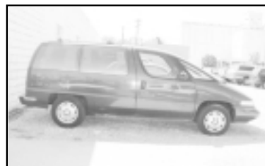
'91 CHEVY LUMINA APV $2,999