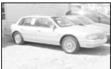
'92 LINCOLN CONTINENTAL Silver $2,999