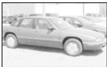
'95 BURELL REGEL - Blue $5,999