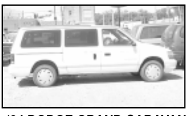
'94 DODGE GRAND CARAVAN AWD, White $1,999

1-800-834-2338 • 785-462-3317 Visit us online at: www.frontierautoplex.com