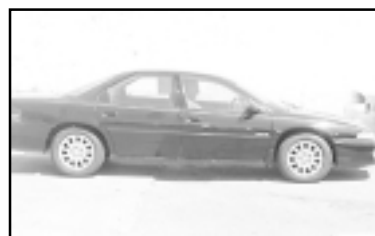
'97 DODGE INTREPID - Black $5,499