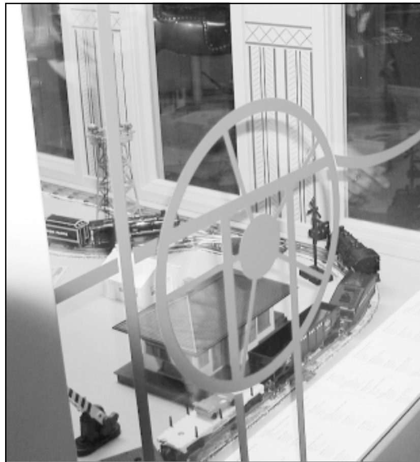
The Train Exhibit