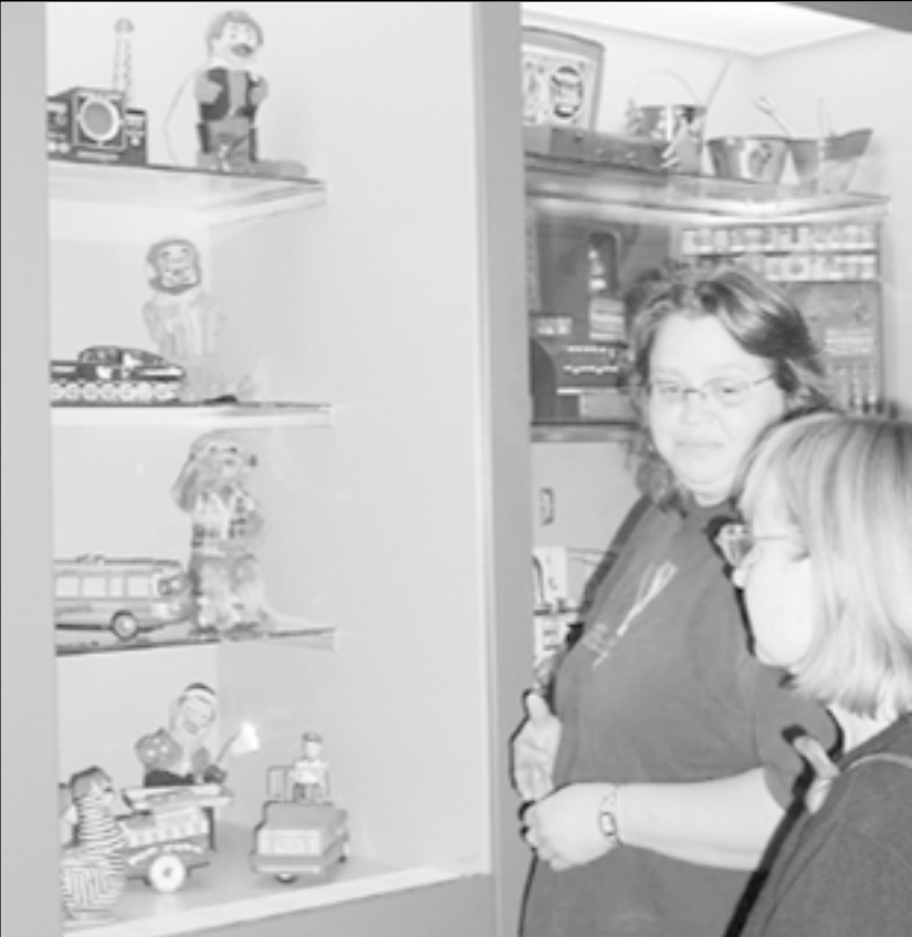
The Toys Exhibit

the site in the early 1980s and displays furniture, clothing and objects representing farm life during the trying 1930s. Accompanying the home is the Vacin Barn where farm animals such as goats, sheep, chickens and cows are kept in the barn in the summer. The 1915 country Lone Star Church and the 1887 one-room Nicol School were moved to the site in the late 1980s and denote the importance of education and faith to the settlers. The Cooper Barn, one of the largest barns in Kansas, was moved to the site in 1992. It houses "Prairie Grasses to Golden Grains: Agriculture on Northwest Kansas, 1870s-1990s" an exhibit of machinery, tools and photographs telling over 100 years of agricultural and settlement history. For more information contact the Prairie Museum of Art and History, 1905 S. Franklin, Colby. (785)672-4590 or check out the web site at prairiemuseum.org . Hours at the museum are 9-5 Monday - Friday and 1-5 Saturday and Sunday. During the summer the museum has extended hours and from November - March it is closed on Mondays.