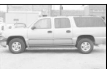
'02 CHEVY SUBURBAN 21K Miles $32,000