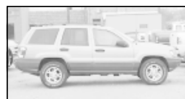
'01 JEEP GRAND CHEROKEE - 27,500 Miles $22,000

Get Ready For Winter! ~ 4X4's In Stock ~