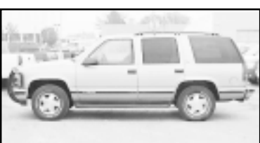
'98 GMC YUKON - 68K Miles, Leather/CD $18,500