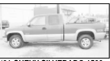
'01 CHEVY SILVERADO 1500 - 34K Miles $23,999