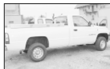
'99 DODGE RAM 1500 - 80K Miles, $13,000