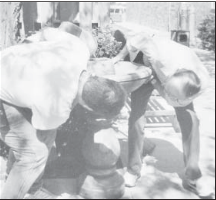
Citizens Medical Center's courtyard recently added a fountain which was donated by the hospital's auxiliary.

half foot fountain does just that, she said. "Its water sounds and beautiful structure add greatly to the Courtyard, which has also had a bit of a facelift itself," she said. A group of employees volunteered their time and resources to purchase landscaping material and flowers. The new area of flowers is located in the very same portion of the Courtyard as the fountain. The Auxiliary does, and has done much for the hospital over the years. The new fountain is just another example of their good works that will last for many years to come. We are very grateful.