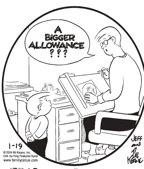
"Billy! Do you realize you're asking to be written out of the feature?"