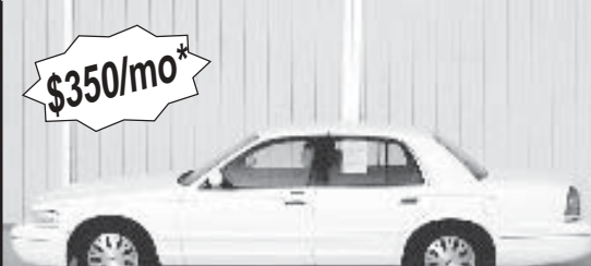
2003 Crown Vic LX, Loaded, Vibrant White w/Charcoal Cloth, 12k miles