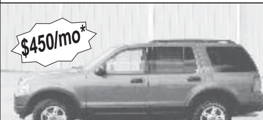
2003 Ford Explorer XLT, 4x4, V-6, Estate Green w/Gray Cloth, 3rd Seat, CD, Trailer Tow, 17k miles