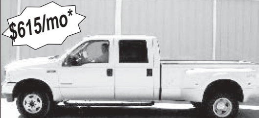
2002 F350 Crew 4x4, XLT, Diesel Dually, White, Powerstroke, Auto, Long Box, 61K miles