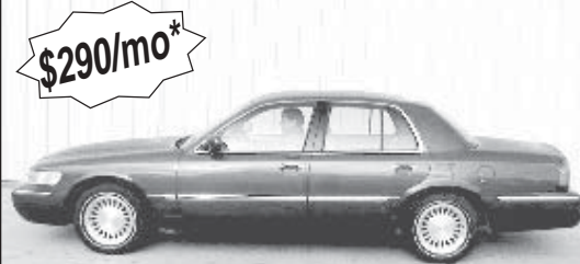
2002 Mercury Grand Marquis LS, Red w/leather, 44K miles