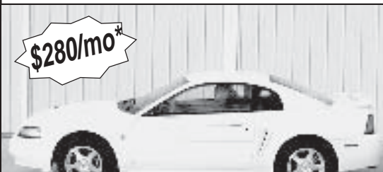
2003 Ford Mustang, White, Full Power, V-6 Coupe, 11K miles