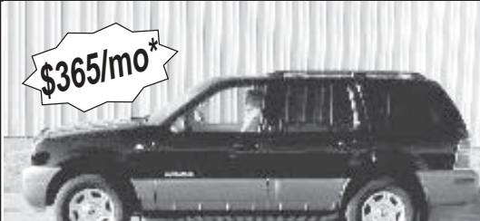
2002 Mercury Mountaineer, Black w/Black Cloth, 4 Door, AWD, 4.0L V-6, 3rd Seat, Rear Air, 31K miles