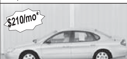
2003 Ford Taurus LX, All Power, Silver, 22k miles