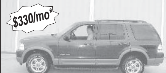
2002 Ford Explorer, XLT, 4 Door, 4x4, Green w/Tan Cloth, 4.0L V-6, Auto, Rear Air, 3rd Seat, 87K miles