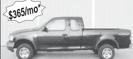
2002 F150 Supercab XL, 4.6L EFI V-8, 5 Speed Manual Transmission, 4x4, A/C