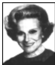
Abigail Van Buren

I have concentrated on my children, my career and my financial portfolio. But now that my kids are