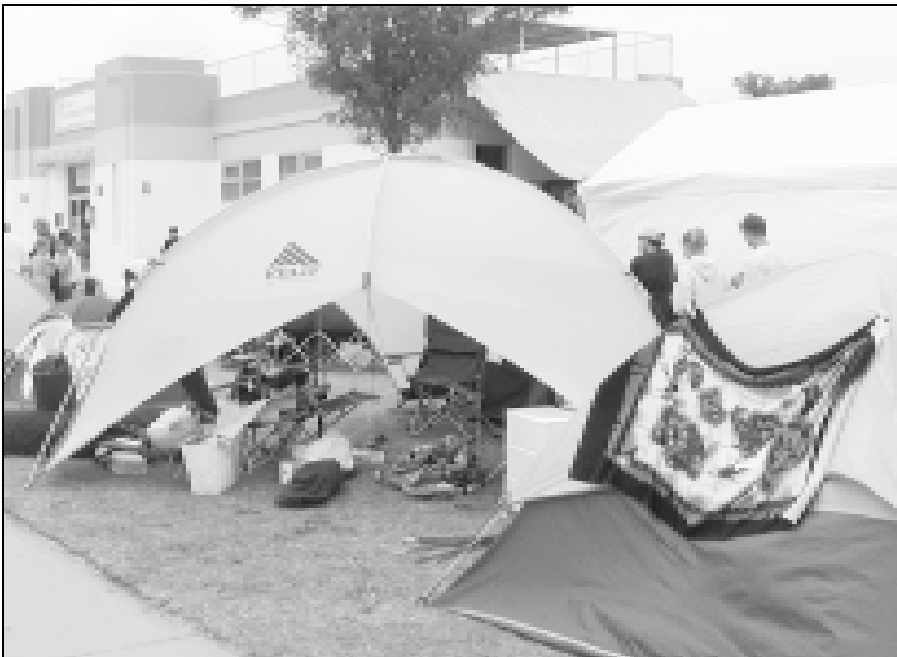
TISHA COX/Colby Free Press