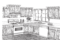
Cabinets Counter Tops

Stop in today to plan your next home improvement project!