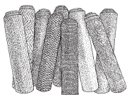
All types of Floor Covering

Professional Designers and Installation Serving you since 1975