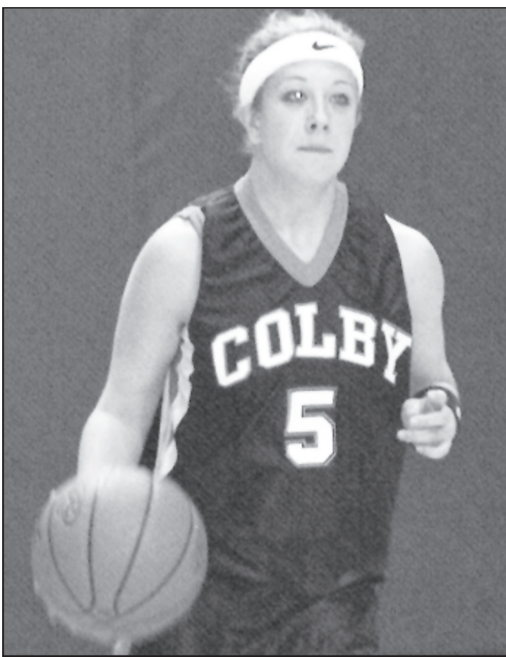
held Sunday at the Colby Community Building. The game was sponsored by Colby Community College, the Sports Shoppe and Colby Bowl.