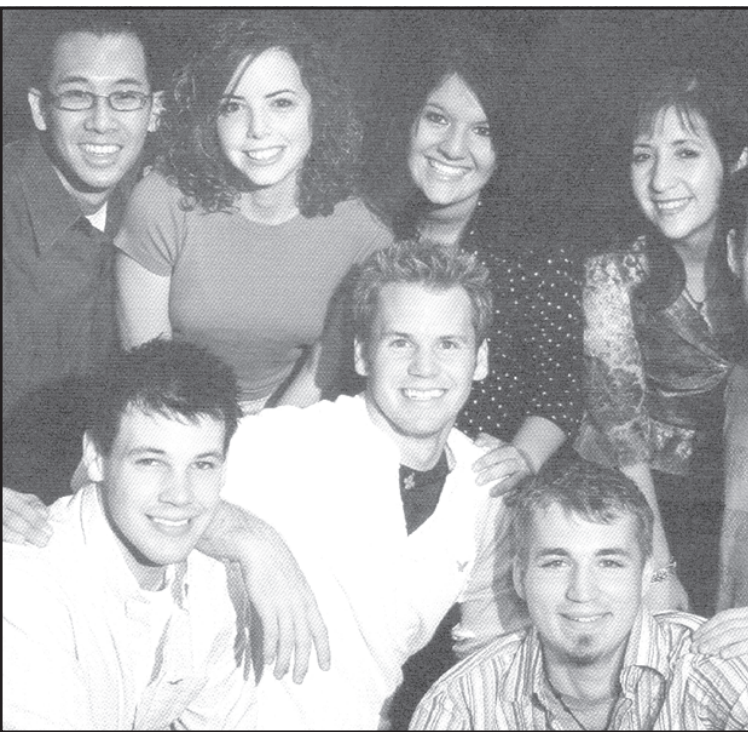
The members of "Jeremiah People." They will perform in Colby next week at the Berean Church.

Christian musical drama group Jeremiah People will perform at 7 p.m. Thursday, April 27 at Colby Berean Church, 1000 S. Franklin.