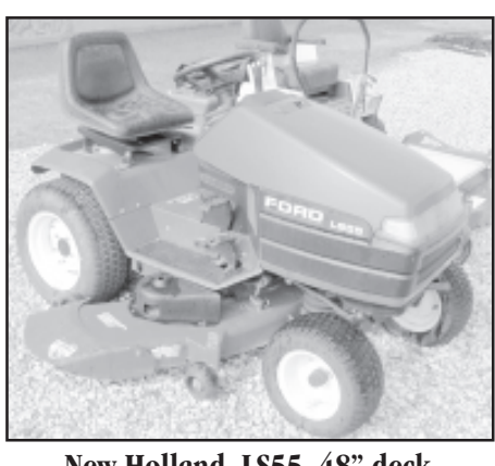
New Holland, LS55, 48" deck $1,950

New Holland CM 272, Diesel, 72" deck $5,950