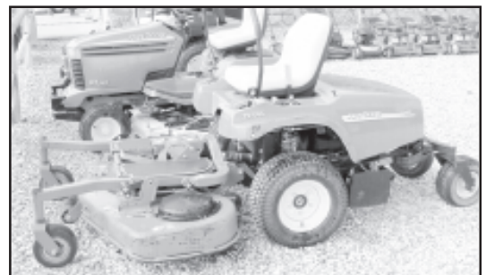
JD F687, 54" Front Deck, only 110 Hours $6,600