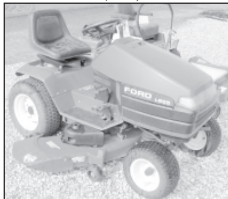
New Holland, LS55, 48" deck $1,950