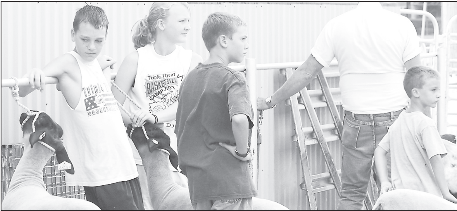
A group of 4-H youth waited to wash their sheep before they and their animals were judged Wednesday at the Sheridan County Fair in Hoxie. The fair and carnival run through Saturday. A rodeo will take place at 8 p.m. Friday and Saturday nights.