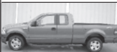
2005 F150 STX Supercab 4x2, Shadow Gray w/Cloth, V-8, Aluminum Wheels, 17K Miles $19,625