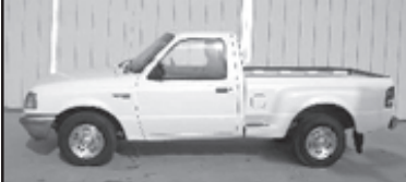
1997 Ranger 4x2, White w/Gray Cloth, 4 Cyl., 84K Miles $4,995