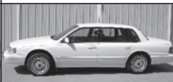
1994 Continental, 4 Door, White w/ Gray Leather, 6 Cyl. $2,495