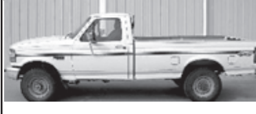
1996 F250 XL 4x4, White w/Red Cloth, V-8 $6,500