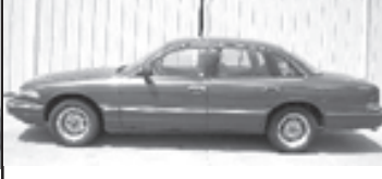
1997 Crown Vic LX, Touring Package, Red w/Gray Cloth, 70K Miles $6,995