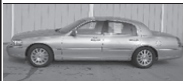
2006 Town Car Executive, Blue w/ Gray Leather, 11K Miles, Loaded! $27,500