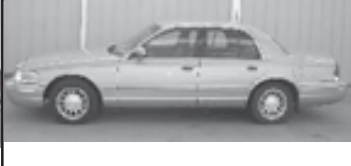
1999 Crown Vic LX, Blue w/ Blue Cloth, 4.6L V-8, 82K Miles $7,500