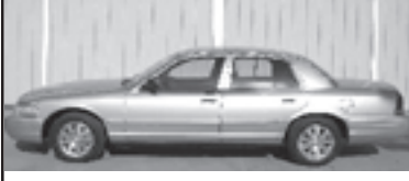
2006 Crown Vic LX, Silver w/Black Leather, V-8, Dual Power Seats, Loaded, 11K Miles $18,995