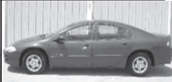
1999 Intrepid, Red w/Flint Cloth, 6 Cyl., 66K Miles $5,850