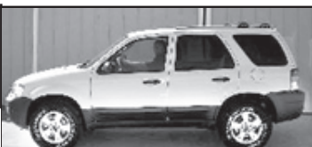
2005 Escape XLT, White w/ Gray Cloth, V-6, 12K Miles $19,850