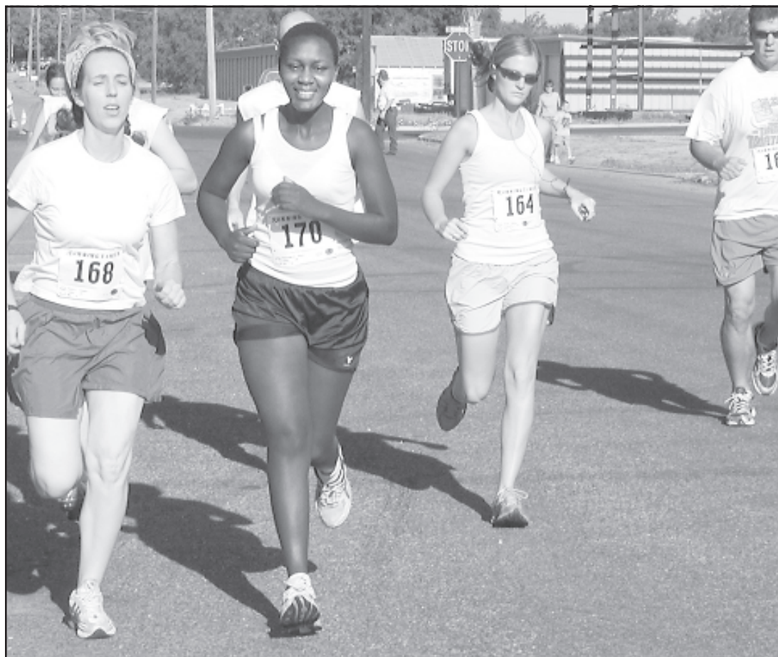
A group of runners took off from the starting line Saturday in the first leg of the 11th annual Nine Run Run event. The run that started from Fike Park benefits Thomas County Emergency Medical Services.