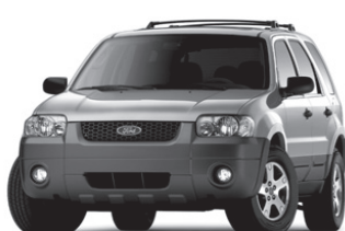
2006 FORD ESCAPE

Ford F-150 is the strongest full-size pickup † and is the most awarded truck out there.