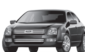
2006 FORD FUSION