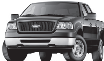
2006 FORD F-150

Ford F-150 is the strongest full-size pickup † and is the most awarded truck out there.