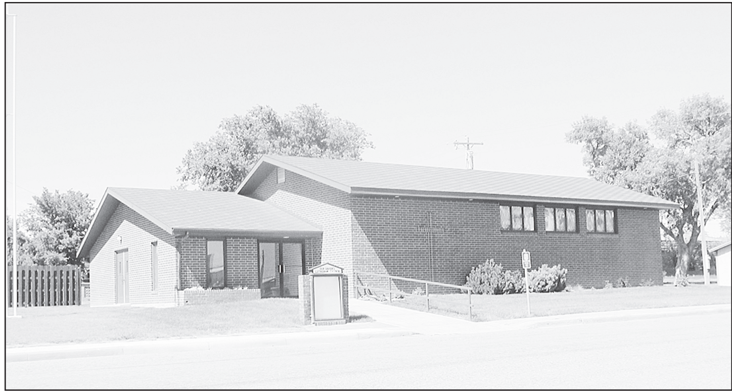
OUR SAVIORS LUTHERAN CHURCH, Brewster, Sunday worship 9:00 a.m.; 2nd Sunday of the month at 8:00 a.m.