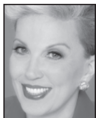
Abigail Van Buren

But keep in mind that although your dream is to be a stay-at-home mother and wife, not everyone who marries winds up living that kind of life. Widowhood, divorce or a spouse's illness can change those plans in a flash and land a woman in the workplace — where, by the way, a college degree and the breadth of knowledge you're acquiring in liberal arts will help you to succeed. Explain that the next time you are challenged.