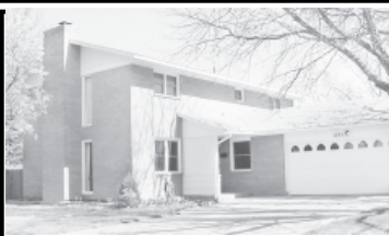
1804 Harvey Court $159,00