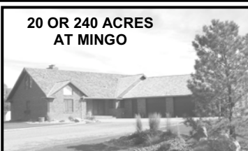
1047 County Road 25 - Colby

• 465 Lawrence Dr • 1796 CR O • 790 W. 5 th