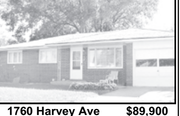
1760 Harvey Ave $89,900