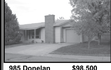
985 Donelan $98,500

THOMAS COUNTY - 160 ac irrigated cropland NE of Levant - immediate possession - JUST LISTED!! RAWLINS - 160 ac irrigated cropland NW of Levant - immediate possession - JUST LISTED!! SHERMAN COUNTY -160 ac irrigated cropland NE of Edson - JUST LISTED!! LOGAN COUNTY: •80 ac cropland S of Monument, immediate possession- JUST LISTED!! •320 ac SW of Winona - 182.7 cropland acres & 133.5 grassland acres - E/2 of 22-12-36 WALLACE COUNTY - 18 ac w/ 5 BR home located South of Wallace- JUST LISTED!!