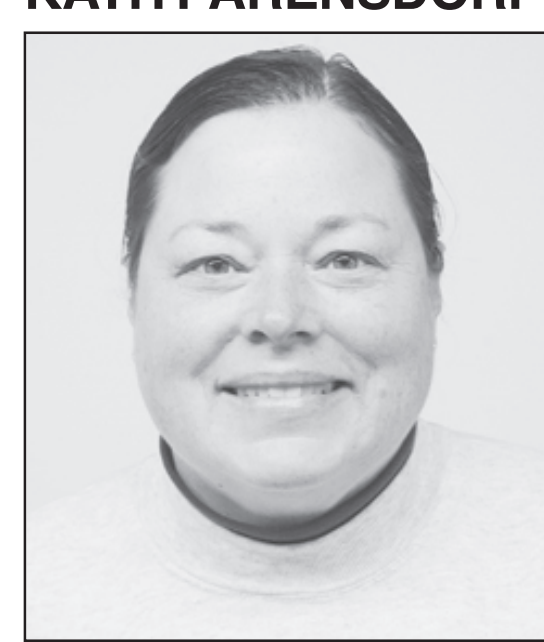
Got ticket from Prarie Skillet