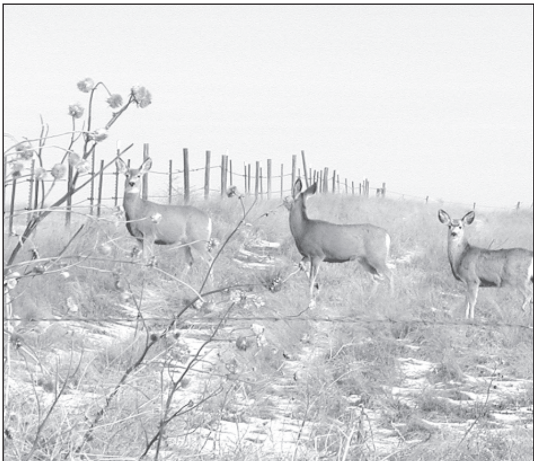
Deer approach a fence in a Northwest Kansas field. Kansas' firearms deer hunting season begins today and lasts through Dec. 10.