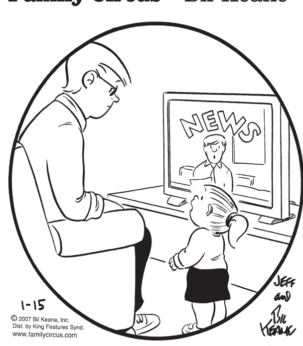
"When the president has a cabinet meeting, how can they all fit in one cabinet?