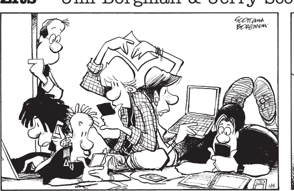
Jim Borgman & Jerry Scott

©2007 Conceptis Puzzles, Dist. by King Features Syndicate, Inc.