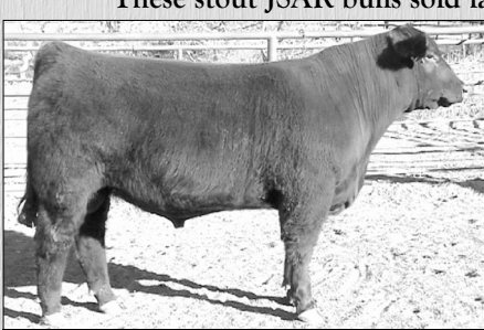
ISAR Mr Hall of Fame 9056HR sold to

• 60 Extra Stout 2-Year-Olds • 50 Carcass-Superior Yearlings of Popular Pedigreed Outcross Genetics These stout JSAR bulls sold last year. Don't miss out on this year's crop!