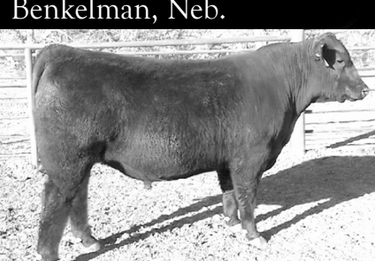
JSAR Mr Hot Rod 266BHMR sold to

1 p.m. MST • At the Ranch, Benkelman, Neb.