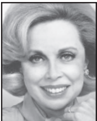
Dr. Joyce Brothers

Dear Dr. Brothers: Both my husband and I are concerned about our daughter’s success at her first job