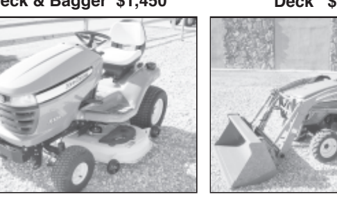
NEW JD X 324 w/54" Deck