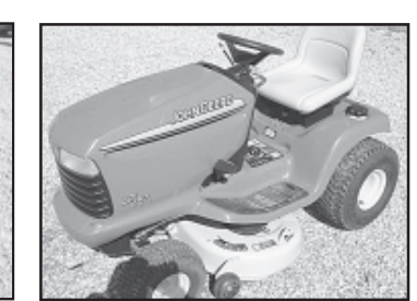
JD LT 160 w/42" Deck $1,950