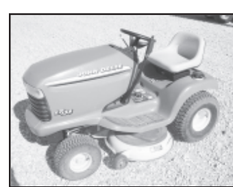
JD LT 155 w/ 42" Deck $1,050