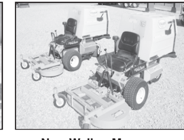
New Walker Mowers

Loader $12,500 42 & 48in. decks Walk Behind Mowers Riding Mowers