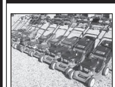
Nice Selection of Walk Behind Mowers