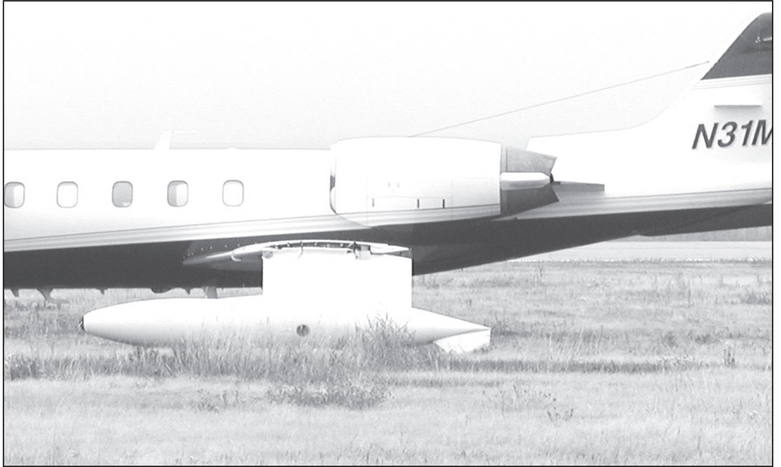
A jet rests near the Goodland airport after it crashed during landing at Renner Field in Goodland on Wednesday morning. There were no injuries to the pilot or passenger. The jet was owned by a Texas corporation, and the pilot told a state trooper he must have hit the runway with the wing when he was landing.