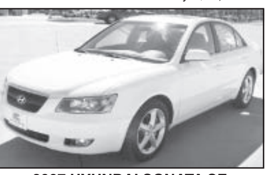
2007 HYUNDAI SONATA SE Sunroof, 22K miles $16,900