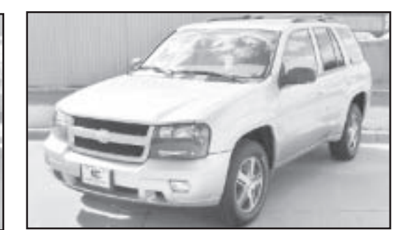
2007 CHEVY TRAILBLAZER LT 4x4, Heated Leather $24,500

1998 Honda Civic, 5 spd, runs good, 158K.............$1,999