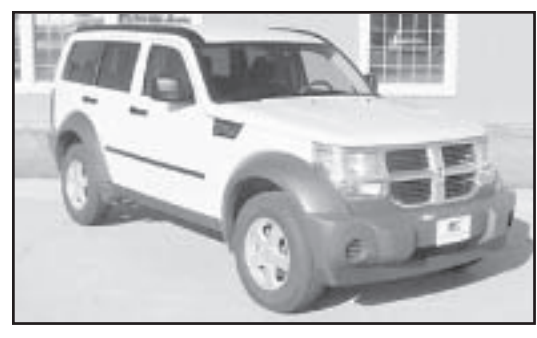
2007 DODGE NITRO SXT 4x4, Only 13K miles $21,500