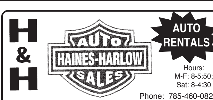
930 S. Range Colby, Kansas 67701

Phone: 785-460-0828 Fax: 785-460-0829 Cell: 785-443-1082