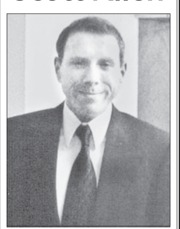
I miss you everyday!