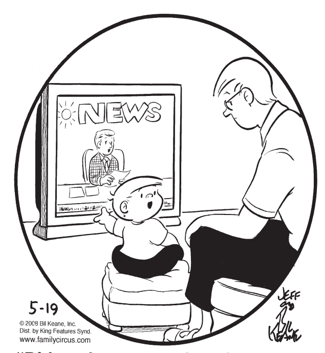
"Did anchormen and anchorwomen start out as anchorkids?"