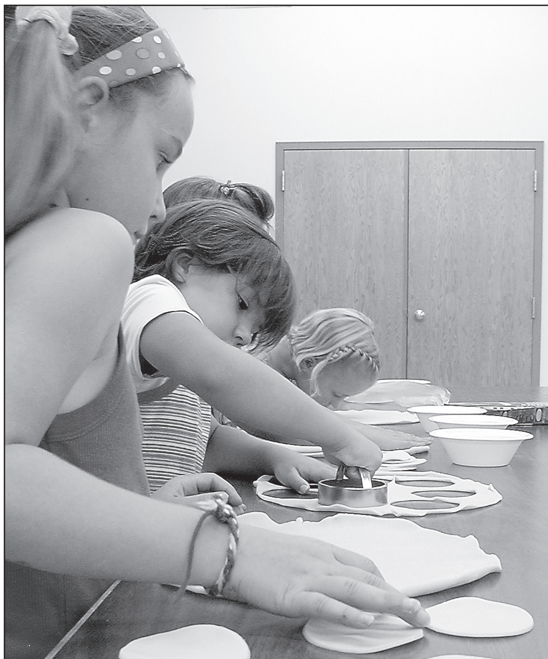
JOHN VAN NOSTRAND/Colby Free Press

Youth prepared to make fortune cookies Tuesday at Colby United Methodist Church. The church has offered a variety of classes for youth from pottery, cooking and model rockets.