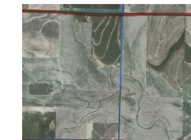
(Published in the Colby Free Press July 9, and 16, 2008.)