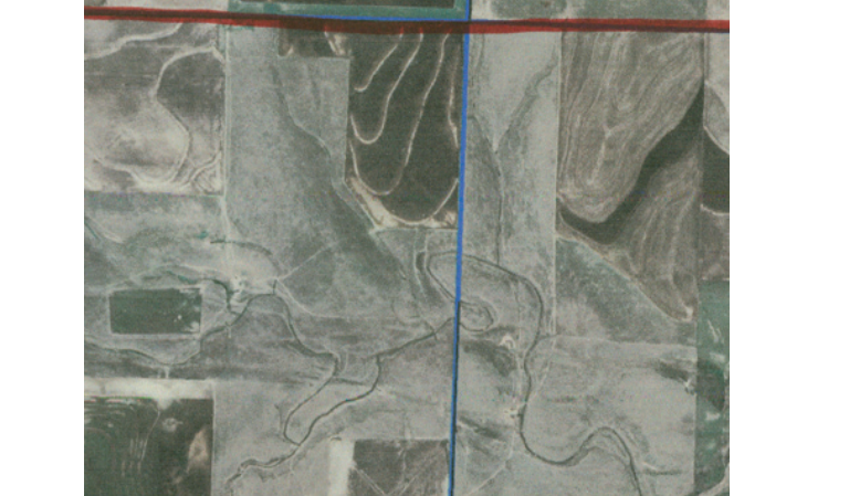
(Published in the Colby Free Press July 9, and 16, 2008.)